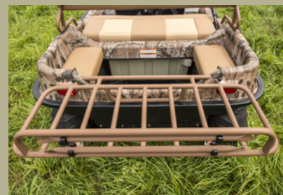
Removable, fold down rear rack