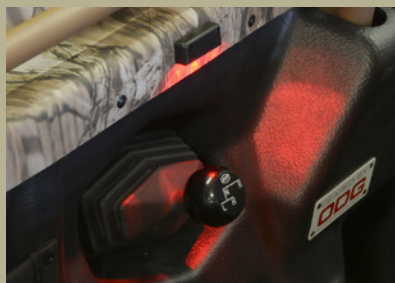
Interior lighting package