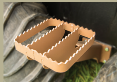
Right and left entry step