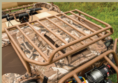
Easy removable hood rack