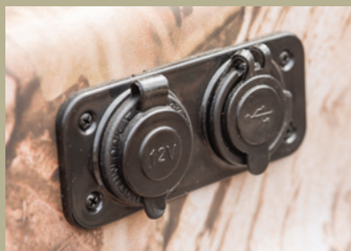
12V / Dual USB power outlet