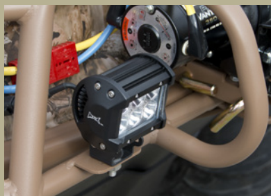
Exterior lighting package