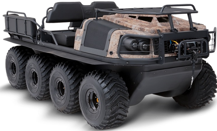
TrueTimber® Prairie Camo