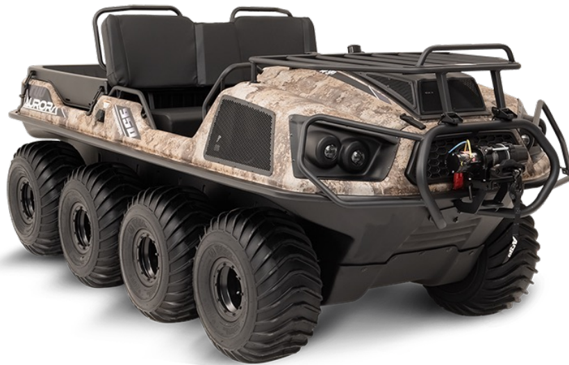
TRUETIMBER® PRAIRIE CAMO