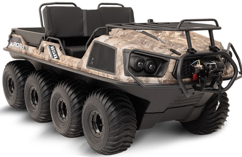
TRUETIMBER® PRAIRIE CAMO